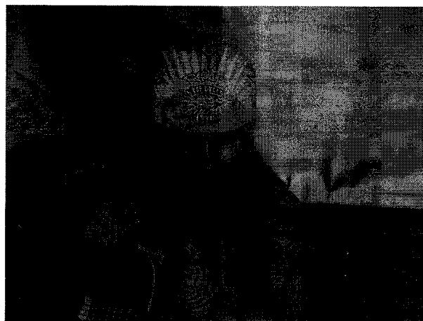
Figures: Lectures in Cultural Centre in Užice